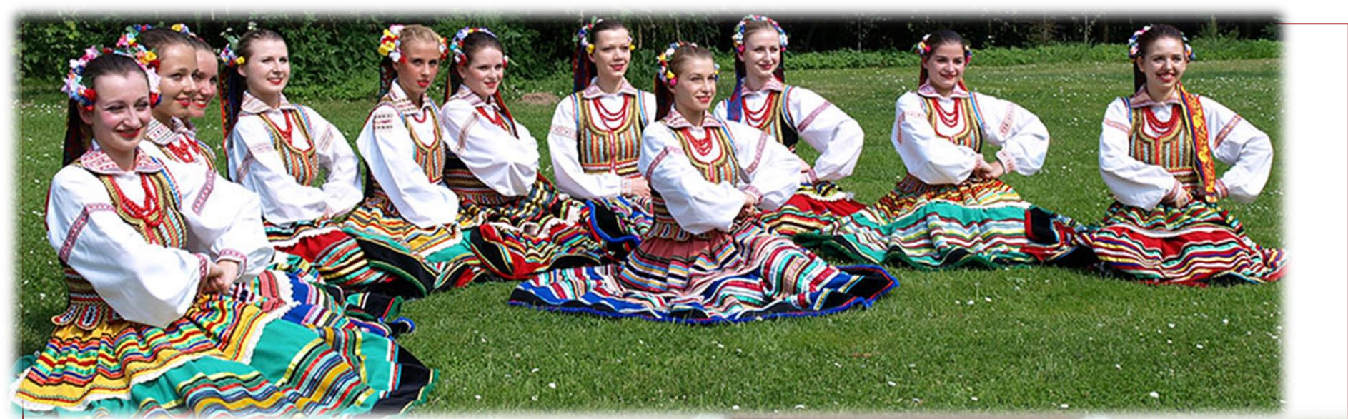
Song and Dance Group of the Medical University in Lublin