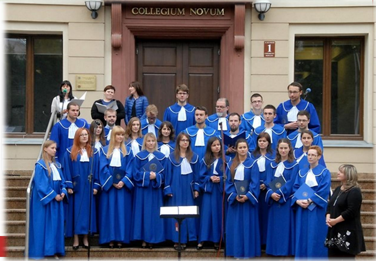
Academic Choir of the Medical University in Lublin